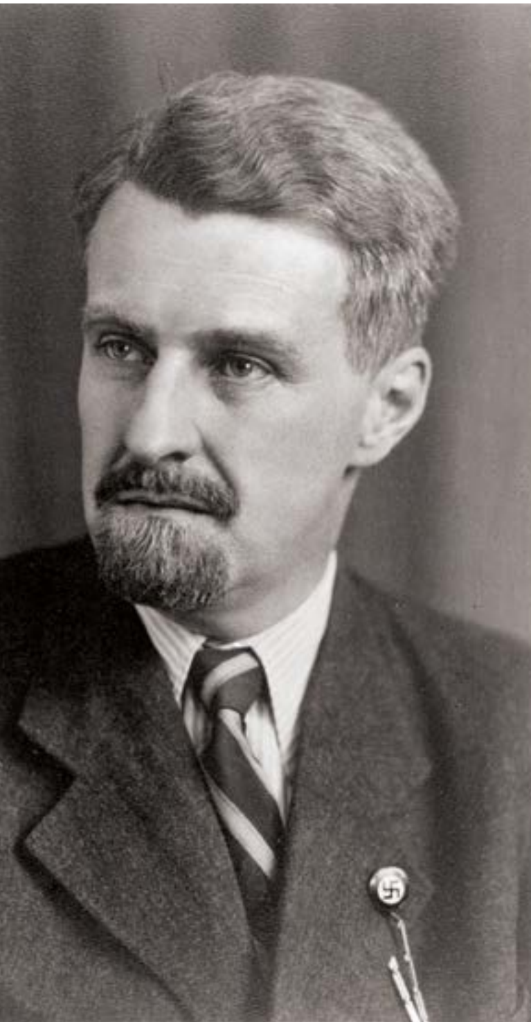
In 1973, Konrad Lorenz received the Nobel Prize in Physiology or Medicine. In the 1940s, Konrad, a member of the Office of Racial Policy of the NSDAP, had demanded that a «scientifically underpinned race policy» eradicate inferior elements from society. In the picture, a 1940 photograph shows Lorenz with the Nazi pin in his lapel.