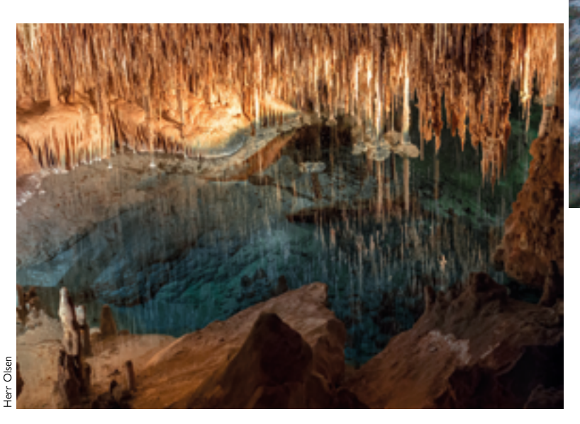
It is often said that to contemplate nature aesthetically inevitably involves seeing it through the prism of art. Would this position mean that we expect from nature – turned into a nature-product – only what art itself has accustomed us to expect from it? The image shows the Coves del Drac in Mallorca (Spain).

«What nature is actually being imitated? Something already given and known, subject to conventions, ascribed to ideologies?»