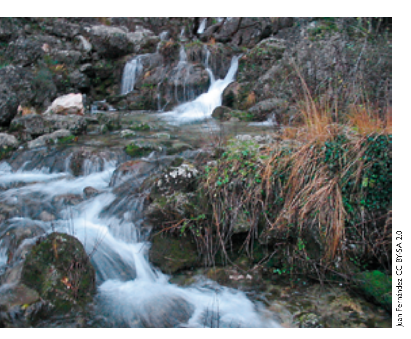
In nature, we are faced with an object that is not always perfectly defined. Its shape is not presented in a fixed and immutable way. The image shows the Mundo River spring in Albacete (Spain).

When experiencing nature, a person's aesthetic experience might be faced with new and different demands for attention and selection. In this case, not everything is intentionally given to them. This is why their contemplation is less fixed and directed and they are faced with a series of potentially interfering elements. This, of course, affects them and has a lot to do with the nature of the (natural) object itself. An object that always «announces and presents» multiple interconnected possibilities.