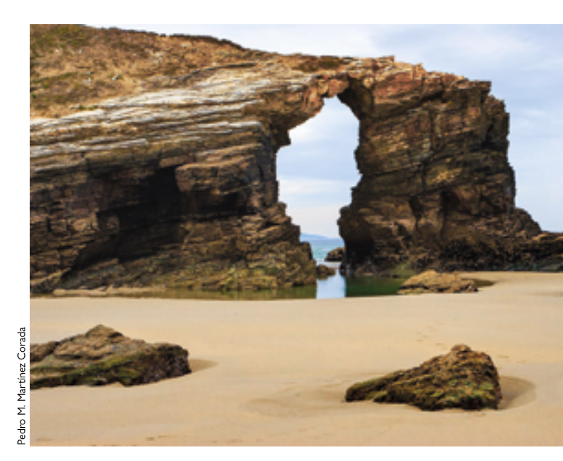
The artistic sphere has been transformed into the usual and exclusive context of our consumerist existence, an immediate result of the society of the spectacle. The image shows As Catedrais beach in Ribadeo (Lugo, Spain).

We must understand that, through artwork (turned into an aesthetic object), human perceivers are making signs for themselves. It is not reality itself that activates