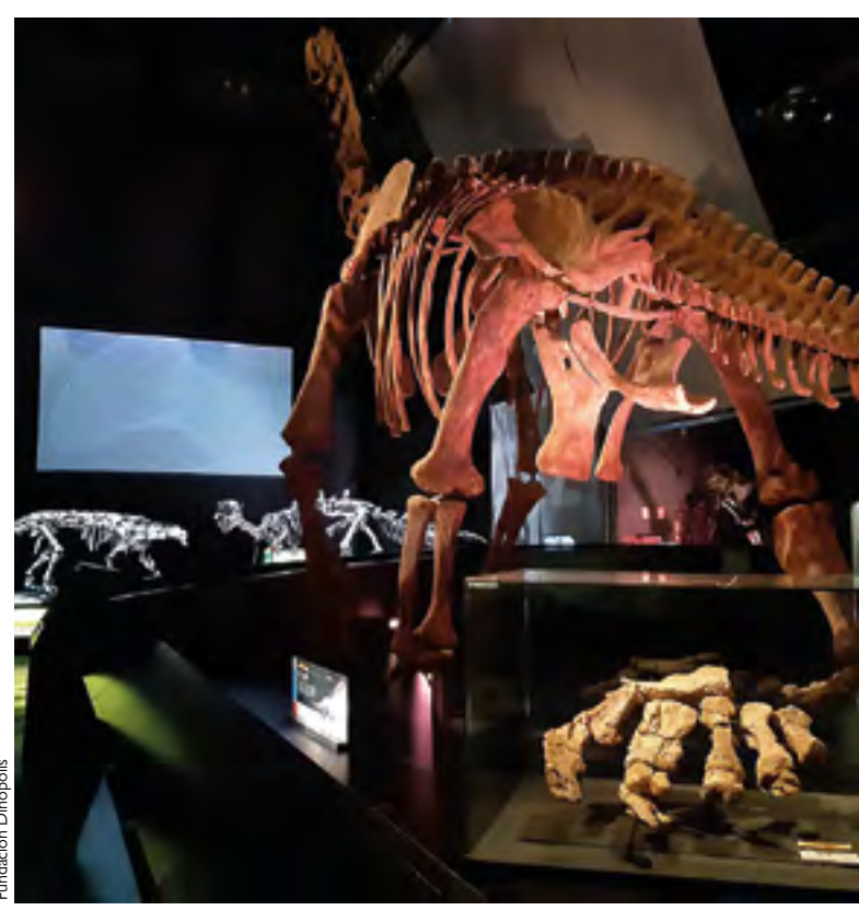
Dinosaur Hall at the Dinópolis Palaeontological Museum in the city of Teruel (Spain). The museum is part of the largest complex in Europe dedicated to the dissemination of our knowledge of the history of life on Earth

There are also other initiatives in Teruel that complement the palaeontological offering of the province. In particular, the Comunidad de Teruel region has set out to make palaeontology its flagship tourist activity, through the DinoExperience brand. The Giant's Route, which links the famous frog fossil sites of Libros and the dinosaurs of Riodeva, and In the Footprints of the Dinosaur, with the ichnite sites of Ababuj, Aguilar del Alfambra, and Galve, are the most important proposals in the area. In addition to the Dinópolis site, the latter also hosts the Municipal Museum and two sites with footprints as well as some reconstructions of local dinosaurs. Finally, the Dinosaur Tracks Road links Galve with El Castellar, among other villages. In collaboration with four local museums, this municipality, with just 60 inhabitants, has created the Dinopaseo ('Dinowalk') and the Dinosaur Route, themed walks about the local dinosaurs. One of these is the only site in Europe where the original fossils can be observed in situ (Cobos et al., 2020).