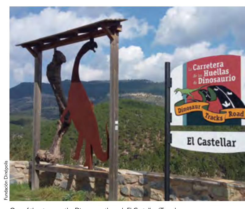
One of the stops on the Dinopaseo through El Castellar (Teruel, Spain), included in the Dinosaur Tracks Road. This municipality, with barely 60 inhabitants, has also developed the Dinosaur Route, which includes four stops adapted as on-site museums.