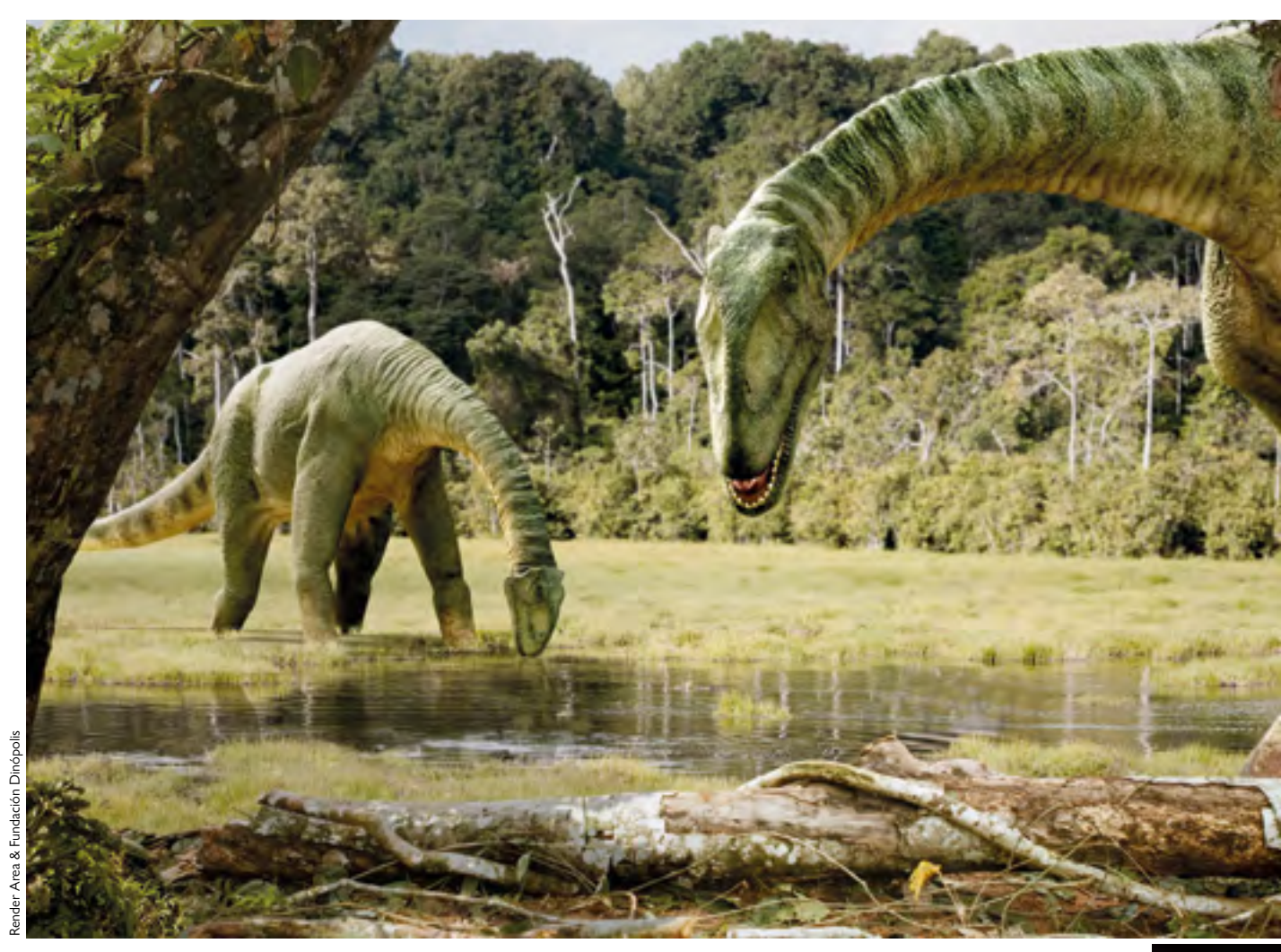
Reconstruction of the sauropod Turiasaurus riodevensis . This is the largest dinosaur in Europe and one of the most representative dinosaurs of the Jurassic period. It was described in 2006 by the scientific team at the Fundación Conjunto Paleontológico de Teruel-Dinópolis (Spain).