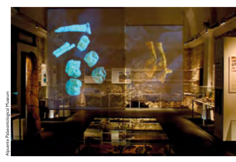
In Spain, palaeontological centres of various sizes have been set up in towns associated with fossils, such as the Alpuente Palaeontological Museum in the Valencian region of Los Serranos (shown in the image).

having a population of less than 30,000 inhabitants and a density of less than 100 inhabitants per km<sup>2</sup>».