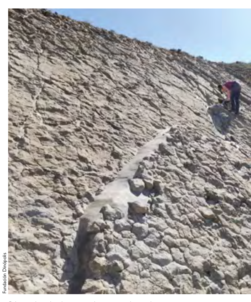
Palaeontological and museum adaptation work on a dinosaur footprint site in Miravete de la Sierra (Teruel, Spain). This village is seriously depopulated, which led to it being the subject of an advertising campaign in 2008 under the slogan «The village where nothing ever happens».