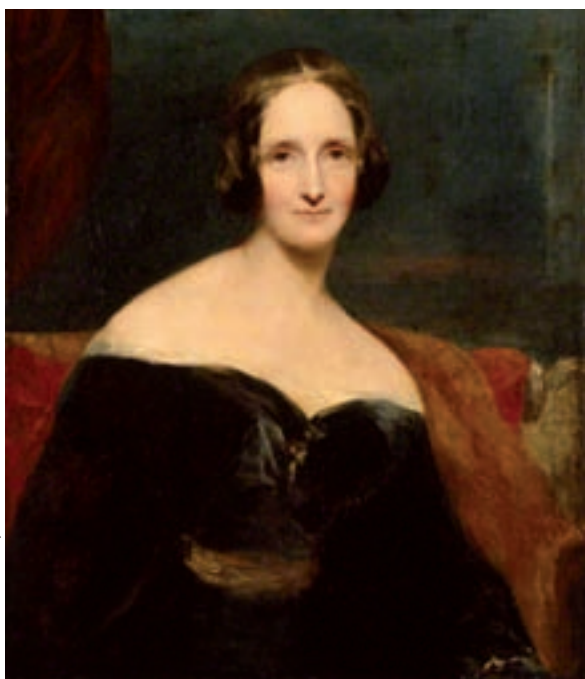
National Portrait Gallery, London