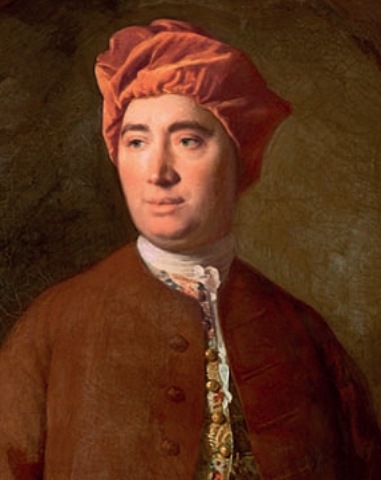
In his book An Enquiry Concerning Human Understanding , published in 1748, the philosopher David Hume argued against believing in miracles because they denied natural laws. In the picture, portrait of David Hume by Allan Ramsay.

There is another class of statements made by religious people, which are favored by theologians and philosophers, and that concern the creator of the universe, or the reason why there is something rather than nothing, or the god of the anthropic principle, or the one of intelligent design, etc. This is what one might call the «metaphysical god». It is always a «god of the gaps», in the sense that it is supposed to provide answers or explanations that science does not provide. Of course, that god does not perform miracles or answer our prayers (at least, none of the arguments advanced in favor of its existence suggest that he does). In that sense, its existence cannot be empirically refuted. But what is more important is that it cannot be characterized in any specific way. Just because there is supposed to be some Being «explaining» what we do not know does not mean that this Being likes us, cares about us, is good or bad or almighty. In short, it has nothing to do with the various gods that actual existing religious people worship and from whom they expect some reward, usually in this life or at least in the afterlife. It is only an abuse of language that allows theologians to speak of the metaphysical god as if it coincided with the one of the gods in which their credulous followers believe.