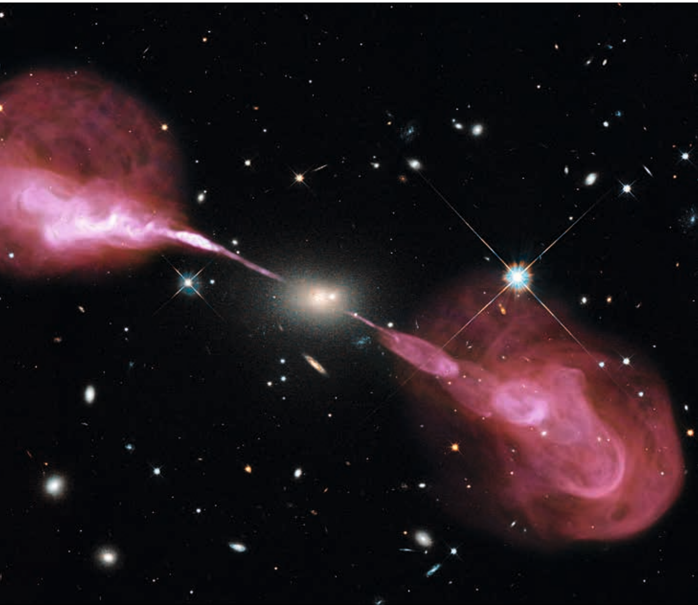
Figure 1. Radio emission (in pink) overlaid on an optical image. The radio emission from powerful radio sources extends much beyond the host galaxy in which the relativistic jets originate.

«STARS, GAS, AND DUST ARE RESPONSIBLE FOR THE GALAXY EMISSION ACROSS THE ELECTROMAGNETIC SPECTRUM, INCLUDING GAMMA RAYS»